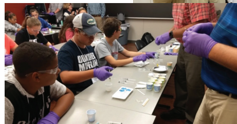
◀ Introducing students to manufacturing