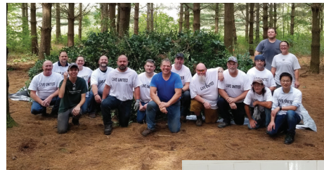
◀ Joining forces with United Way of Licking County to strengthen our community