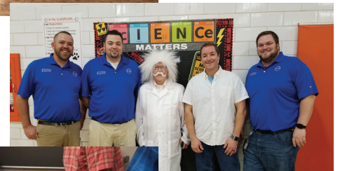
▶ Bringing hands-on science learning to the next generation