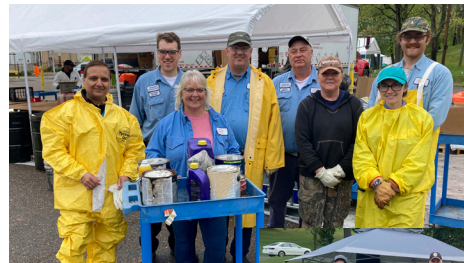
Collecting and disposing of home hazardous waste to create a cleaner environment.