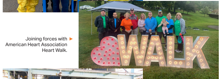
Joining forces with American Heart Association Heart Walk.