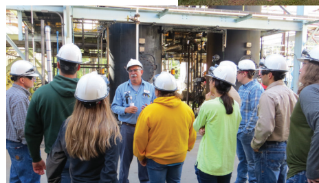
Promoting greater awareness of manufacturing career opportunities