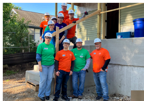
Joining forces with Habitat for Humanity to strengthen our community

Our passionate employees have countless opportunities to take their talents to the communities where we live, work and play, by helping non-profits solve business challenges, raising funds for a good cause, sharing our excitement for science with the next generation, and inspiring a cleaner future.