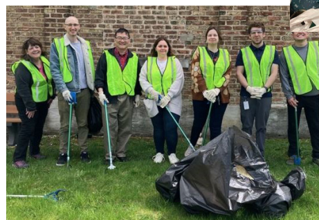
Volunteers on a mission to clean up trash on the community nature path